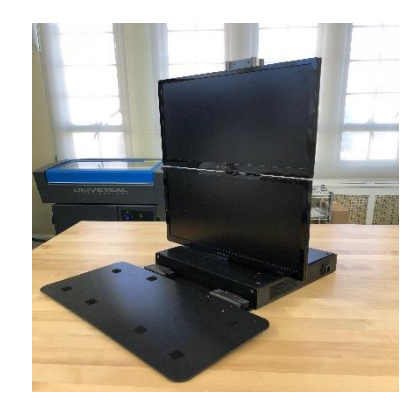
Fig. 12. RoboBlues Command Center.

In our explorations with image processing, our initial approach is to leverage the National Instruments Vision Development Module as it can interface with LabVIEW. If we encounter significant difficulties with this approach, we will explore alternate applications.