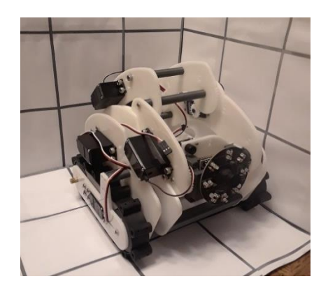
Fig. 1. Working iteration of RoboBlues RMRC Robot (as of June 6, 2019). Lines are spaced 10cm.

H ILL ENGINEERING follows the Engineering<sup>3</sup> [1] curriculum which reflects the DHS/NIST/ASTM [2] test methods for responder robots. In the beginning levels of Hill Engineering the focus is on developing small form factor, advanced mobility, intuitively controlled (teleoperated) mechanical transport systems. In the advanced levels of Hill Engineering the focus shifts to sensor integration, data acquisition and interpretation, and autonomous control. In all levels of Hill Engineering, students work in teams of two to explore various robot design iterations with the best platform(s) selected for entry into RoboCup Rescue RMRC. In general, the RMRC entry will be a single robot incorporating significant