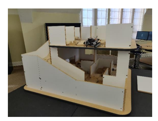
Fig. 13. Test Field; Full View.

We've developed a hybrid RMRC testing field that includes the RMRC terrain elements (dexterity elements to be added; gravel ramps separate) within a 165cm<sup>2</sup>, two-story simulated building. The test field is a permanent fixture in our lab and student teams have open access to the field for testing their robots and determining the viability of all systems related to teleoperaton, navigation, mapping, etc.