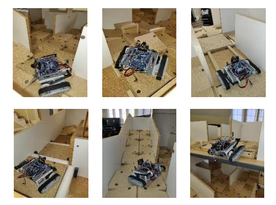
Fig. 14. Test Field; Cross Views.