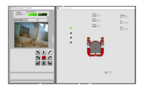
Fig. 11. MainController control interface.

managed by the Engineering<sup>3</sup> MainController custom control interface built on National Instruments LabVIEW software.